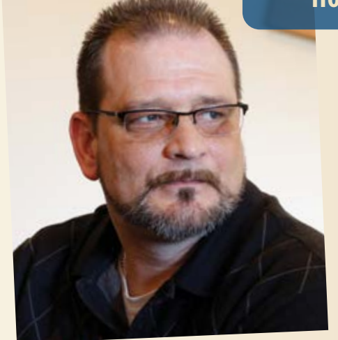
"How can we help? What can we do?"

I really believe that our men and women are able to stand up to anything. That's one thing about our homeless guests and neighbors who are addicted. They are used to adversity. And they are very good at standing up to it. What I noticed was, when we were facing these challenging times, more often than not we were hearing from our residents, "How can we help? What can we do?" They were really taking a sense of pride at being able to serve the guests and other residents.