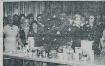
These ladies from the United Methodist Church near Ashton, Ill. made the Rescue Mission the object of their mission day.