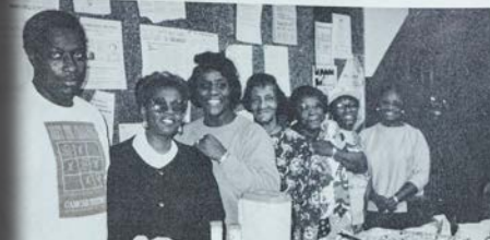
Bethel Baptist Church volunteering at the Mission 1993

Just in the past 30 years, where our records are most reliable, 367 churches have given financially to the Mission. Add to that number the churches who have only sent volunteers or donations of items in that time, and it's 432.